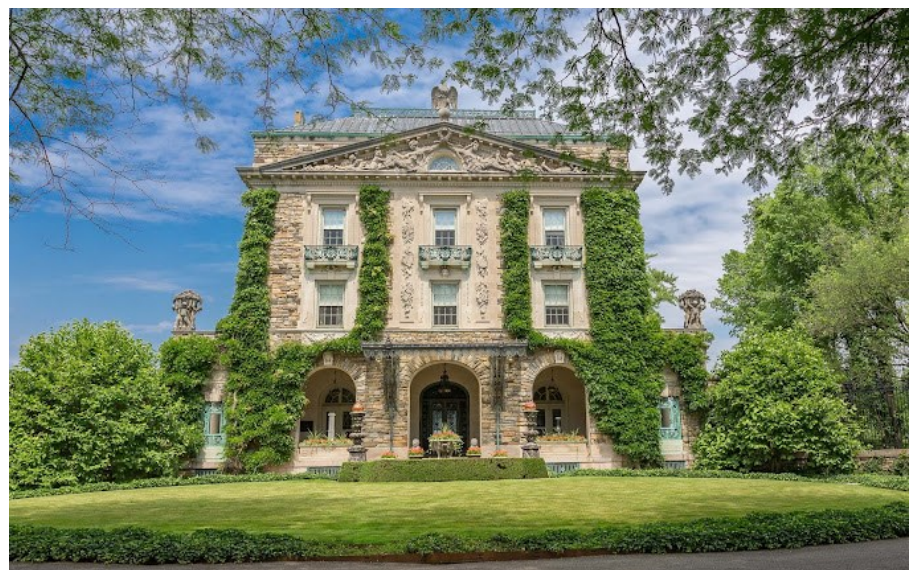
Kykuit, The Rockefeller Estate

GPS address for Visitor Center: 381 N Broadway, Sleepy Hollow, NY