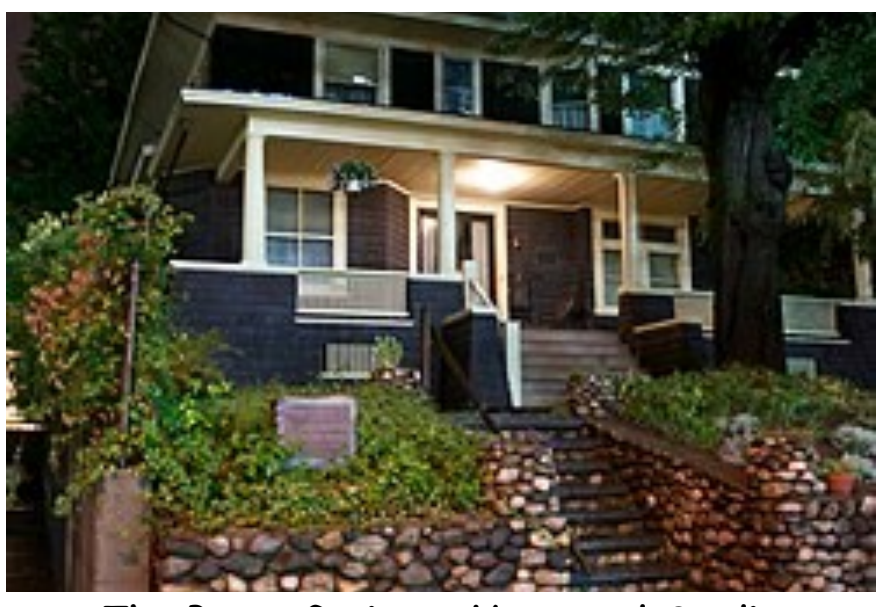
The Percy Grainger Home and Studio