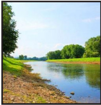
The Beautiful Chemung River

Come join me this beautiful autumn season at the “place of the horns,” as the Algonquin Native Americans called it. I am speaking of course about Chemung County, so named for the Chemung River where the native