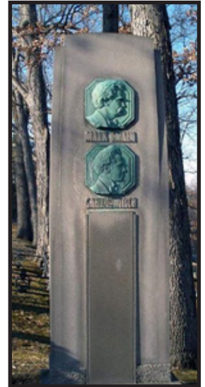
Gravesite monument, Woodlawn Cemetery, Elmira, NY.

On April 21st, 1910, Twain's prediction came true. He passed away of a heart attack in Redding, Connecticut a day after Haley's comet passed by the Earth. Buried with his wife's plot in the Woodlawn Cemetery in Elmira, NY. His grave is adorned with a twelve-foot (two fathoms, or “mark twain”) monument, commemorating his life and work.