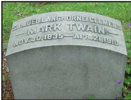
Gravesite of Mark Twain with headstone, Woodlawn Cemetery, Elmira, NY.

the Chemung River, Twain said “once or twice each night, we'd see a Steamboat slipping along in the dark. And every now and again, she'd belch a whole world of sparks up out of her chimney. And they would rain down in the river. And look awful pretty.” It is easy to see how the picturesque Chemung would have stirred up his imagination to write about his childhood by the Mississippi and create the adventures of Tom Sawyer and Huckleberry Finn.