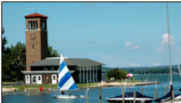
The Bell Tower at Chautauqua Institution.