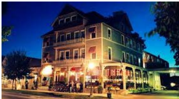
The Inn at Saratoga (Our mixer will be held here in June.)