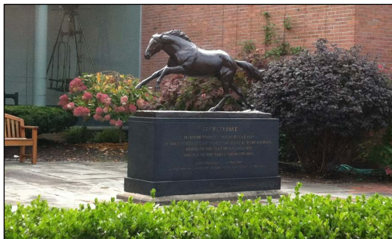
Secretariat statue at the Racing Museum (Our dinner will be held here in June.)