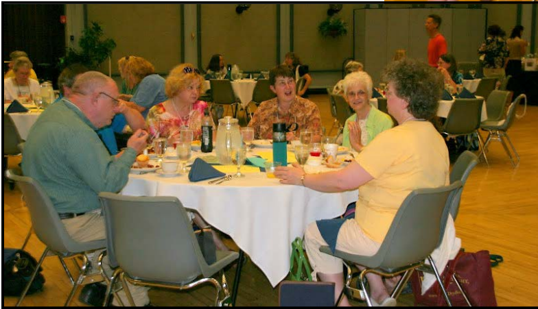
Good food, good conversation