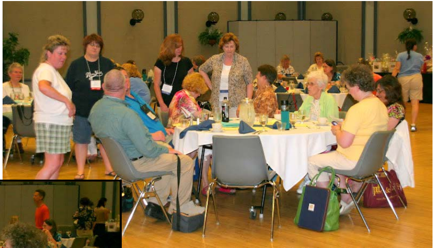
Visiting with old and new friends.