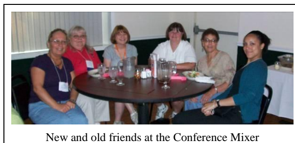
New and old friends at the Conference Mixer