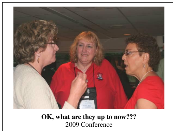
OK, what are they up to now??? 2009 Conference