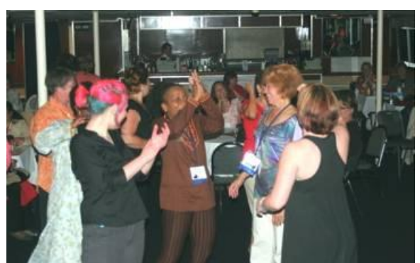
Dancing onboard the Captain JP 2009 Conference