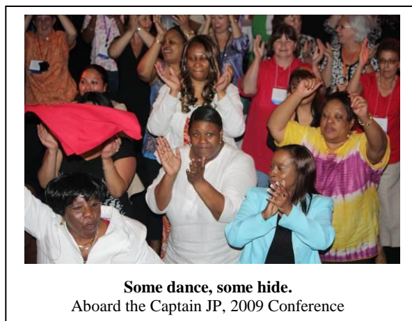
Some dance, some hide. Aboard the Captain JP, 2009 Conference