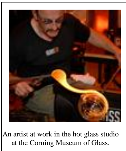
An artist at work in the hot glass studio at the Corning Museum of Glass.

The NYSLAA 32 nd Annual Conference will be held in Corning, NY, June 9-11, 2010. The Conference location will be the Radisson Hotel in Corning and there will also be events at the Corning Museum of Glass. Corning is located in the beautiful Finger Lakes and has a lovely historic business district. Start making your plans to join us!